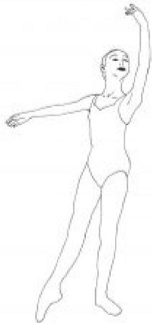
POSITION 1: TENDU DEVANT PAR TERRE EFFACÉ WITH ARMS IN FOURTH POSITION EFFACÉ